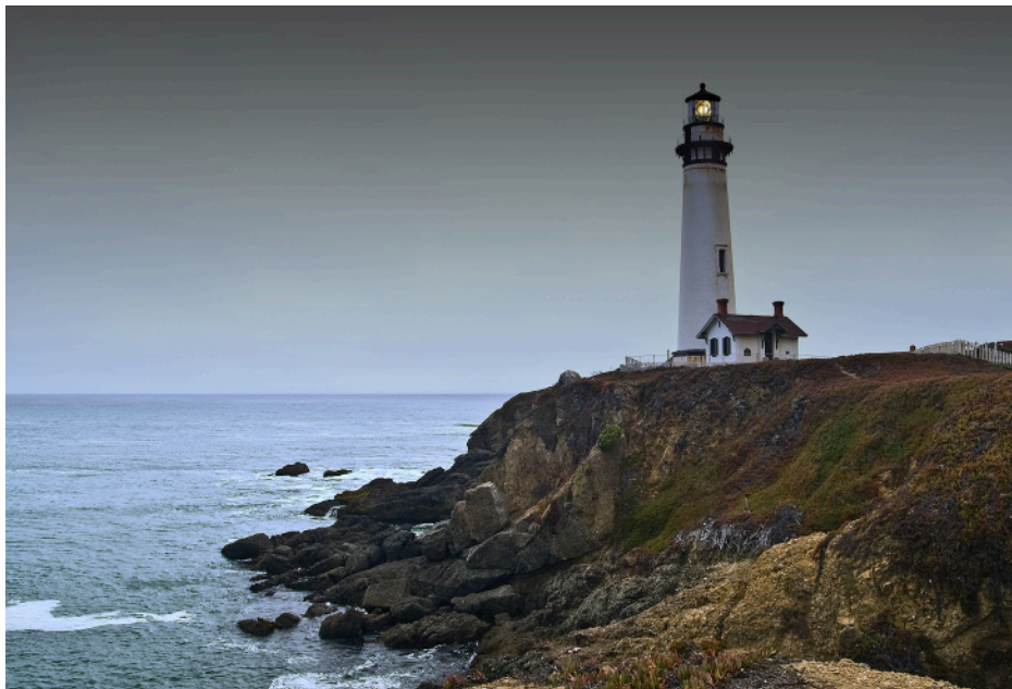
Figure 23.15 Lighthouse. A lighthouse in California warns ships on the ocean not to approach too close to the dangerous shoreline. The lighted section at the top rotates so that its beam can cover all directions.

By applying a combination of theory and observation, astronomers eventually concluded that pulsars must be spinning neutron stars . According to this model, a neutron star is something like a lighthouse on a rocky coast (Figure 23.15). To warn ships in all directions and yet not cost too much to operate, the light in a modern lighthouse turns, sweeping its beam across the dark sea. From the vantage point of a ship, you see a pulse of light each time the beam points in your direction. In the same way, radiation from a small region on a neutron star sweeps across the oceans of space, giving us a pulse of radiation each time the beam points toward Earth.