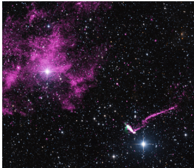
Figure 23.17 Speeding Pulsar. This intriguing image (which combines X-ray, visible, and radio observations) shows the jet trailing behind a pulsar (at bottom right, lined up between the two bright stars). With a length of 37 light-years, the jet trail (seen in purple) is the longest ever observed from an object in the Milky Way. (There is also a mysterious shorter, comet-like tail that is almost perpendicular to the purple jet.) Moving at a speed between 2.5 and 5 million miles per hour, the pulsar is traveling away from the core of the supernova remnant where it originated.